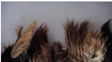
frayed, 2011 DVD - 24 min looped DVD, 1020 x 1080, dv pal, edition 7, 36 x 100 cm $ 2.800