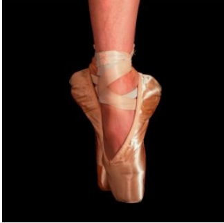
every day i wait, 2010 digital archival print, dry mounted in white frame, edition of 7, 75 x 90 cm, $ 3.000 DVD: 2010, 3:03 min looped DVD, 1020 x 1080, dv pal, edition of 7 $ 2.800