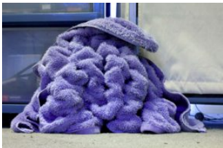
she came in through the bathroom window, 2011 digital archival print on metallic paper, dry + face mounted, edition of 7, 50 x 75 cm $ 2.500