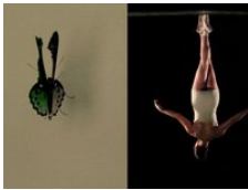
every day i wait, 2010 DVD - 3:03 min looped DVD, 1020 x 1080c dv pal, edition of 7, 170 x 70 cm $ 2.800