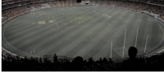
first movement, 2012 DVD - 1:47 min looped DVD, 1020 x 1080, dv pal, edition 7 $ 2.800

CONNIE DIETZSCHOLD GALLERY | SYDNEY | COLOGNE | 99 Crown Street | East Sydney NSW 2010 | Tel: +61 2 9690 0215 | Email: info@connydietscholdgallery.com | www.connydietscholdgallery.com Opening hours: Tue - Sat 11 am - 5 pm